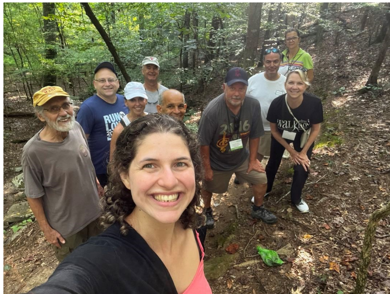
Walkers at Island Forge on Saturday, Sept 9 Next walk is Saturday, October 21